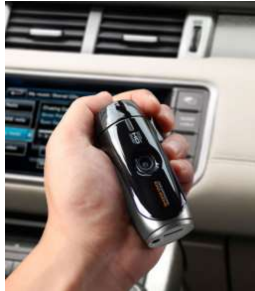
Small, stylish and compact