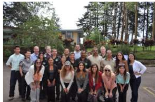
The Fresno State contingent in Costa Rica