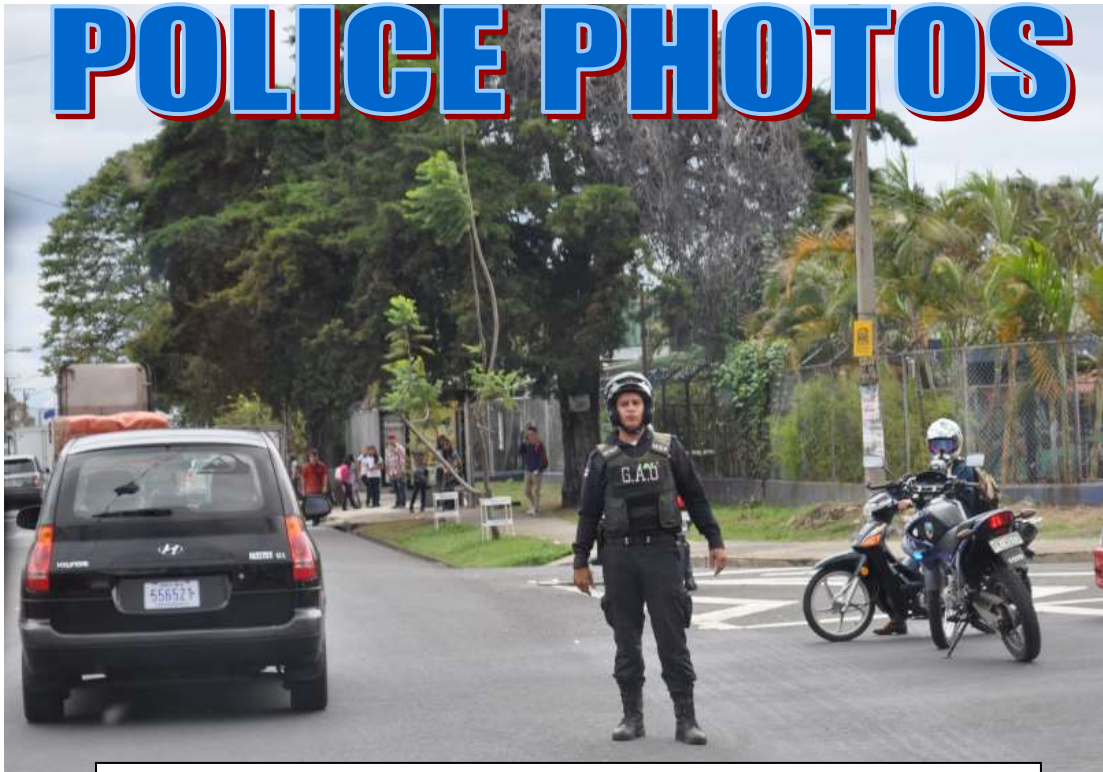
Traffic Police in Cost Rica