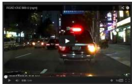
A night shot taken in Seoul

The video format (SD micro card) can be replayed on any computer or smart phone. NOTE: An iPhone is not smart enough to accept an SD micro card.