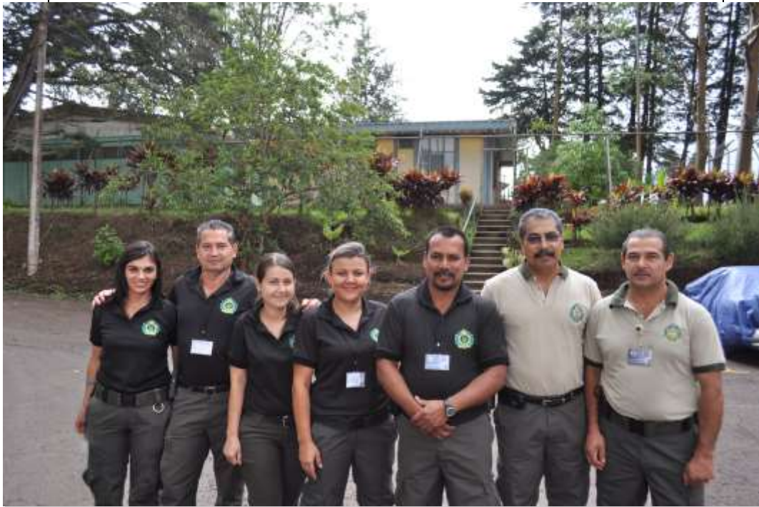
Costa Rican Security Team for Fresno State Visitors